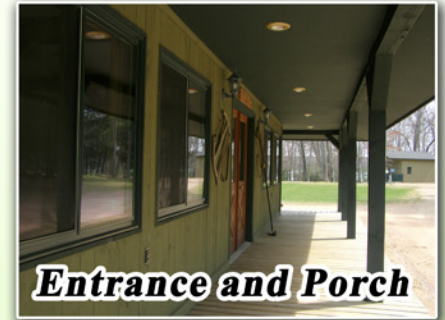
Entrance and Porch