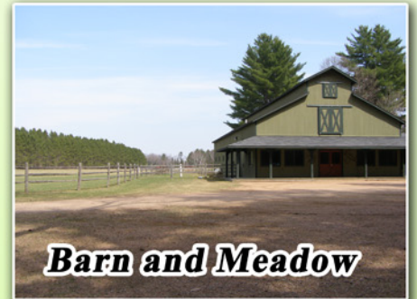
Barn and Meadow